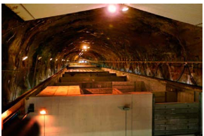
SFR – Final repository for short-lived radioactive waste at the Forsmark nuclear power plant