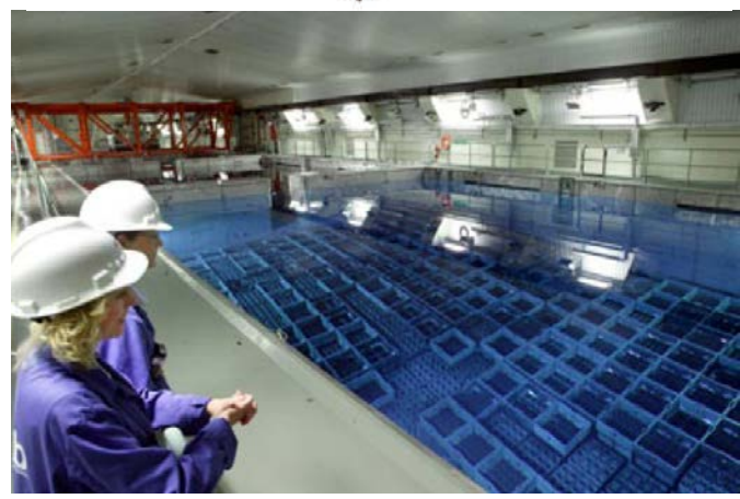
Clab – Central intermediate storage of spent nuclear fuel at the Oskarshamn nuclear power plant